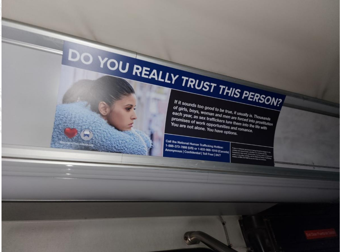
An interior BOTL victim-centered poster in a Peoria CityLink bus