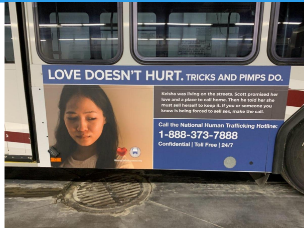
One of four Peoria CityLink buses wrapped with BOTL designs

During National Human Trafficking Awareness Month in January, Peoria CityLink, the public transit system for greater Peoria, Illinois, partnered with Busing on the Lookout (BOTL) to launch an awareness campaign using our victim-centered posters. The campaign included wrapping the exterior of four buses with BOTL's designs for the month, as well as hanging interior posters on all 51 buses in their fleet, which will stay posted year-round. Peoria CityLink has been training all new drivers with BOTL materials since 2020 and plans to train all 140 existing employees during their company-wide safety meetings this month.