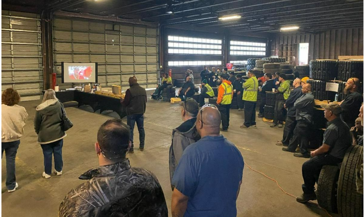
Pomp's is holding training events for employees with TAT materials as they move the newly wrapped trailers from location to location.

July 30 is World Day Against Trafficking in Persons, a global day dedicated to coming together to raise awareness about this important issue. The International Labour Organization estimates that there are more than 40 million people trapped in modern-day slavery across the globe, including forced labor, forced marriage and sex trafficking. That means there are 5.4 victims of modern-day slavery for every 1,000 people in the world. We appreciate all of our partners who have joined the fight to combat this heinous crime.