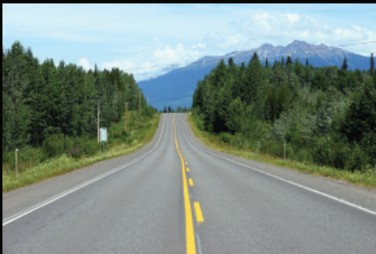
Highway 16, sometimes referred to as “the Highway of Tears” in recognition of the women and girls who have gone missing or been murdered in its vicinity, in northern British Columbia. July 2012.

To address the high levels of violence against indigenous women and girls, Canada should establish an inclusive national public commission of inquiry into the murders and disappearances of indigenous women and girls. British Columbia should expand the mandate of the civilian Independent Investigations Office to include authority to investigate allegations of sexual assault by police. Among other steps, the RCMP, in cooperation with indigenous communities, should expand training for police officers to counter racism and sexism in the treatment of indigenous women and girls.