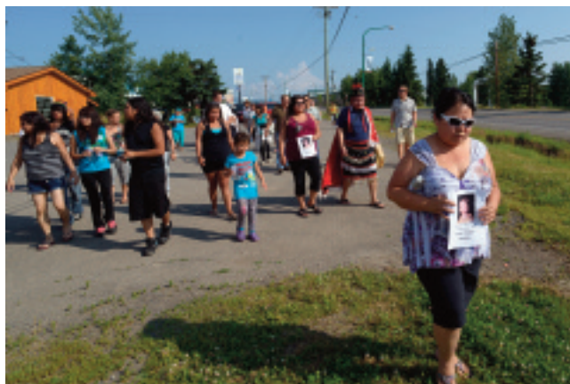
Community members participate in a spirit healing walk in Burns Lake, British Columbia, in remembrance of missing and murdered women.