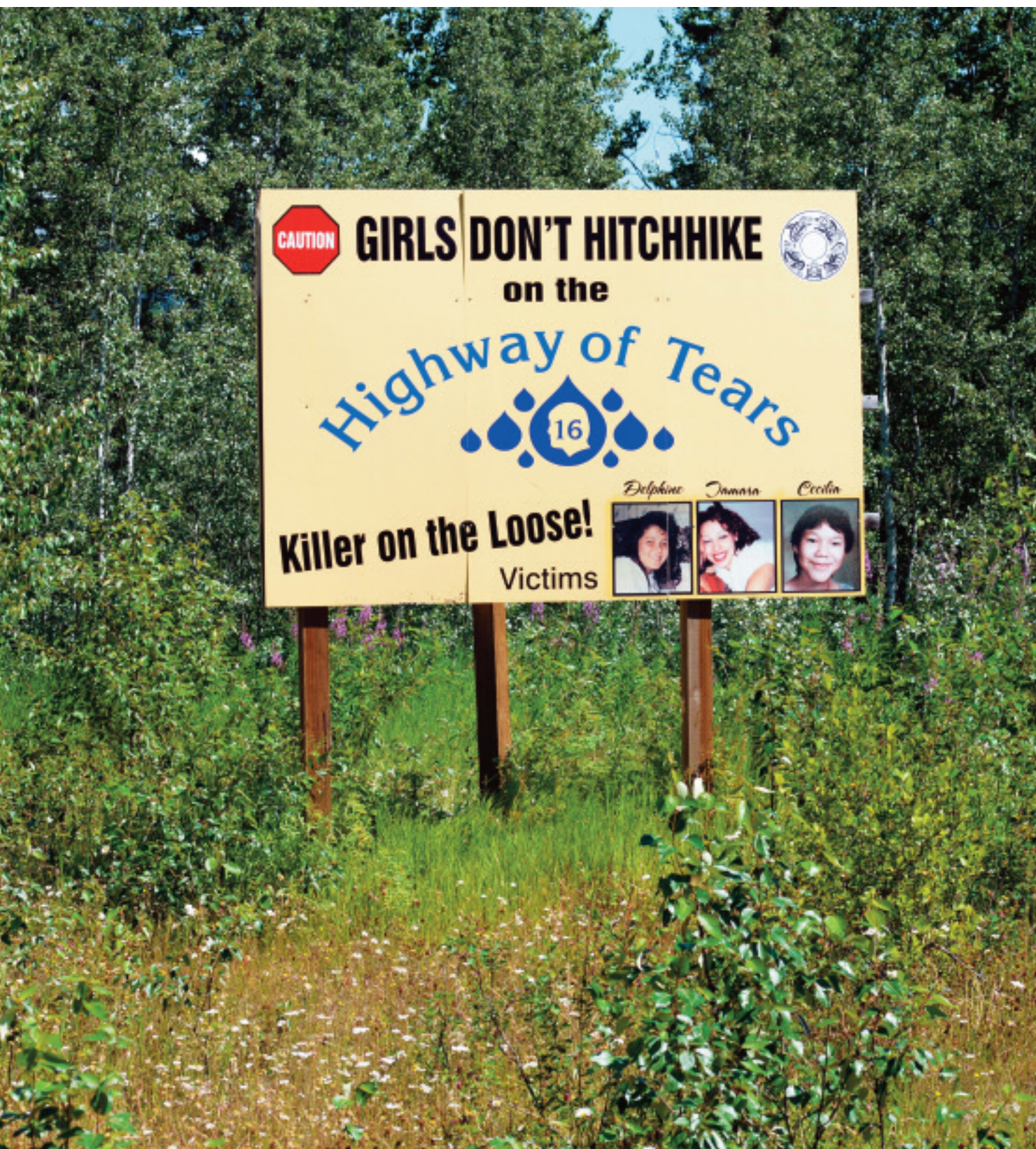
In northern British Columbia, a highway sign warns girls of the dangers of hitchhiking along the Highway of Tears.