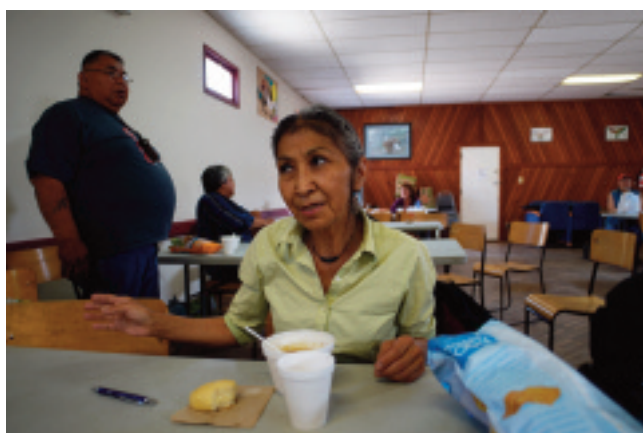
In Terrace, British Columbia, a woman discusses how police told her it was “too early” for them to do anything when she reported that her grandniece (whom she considers her granddaughter) had been missing for 14 hours. She said she told the police: “There are enough girls missing out there already, I want to know where my granddaughter is.”