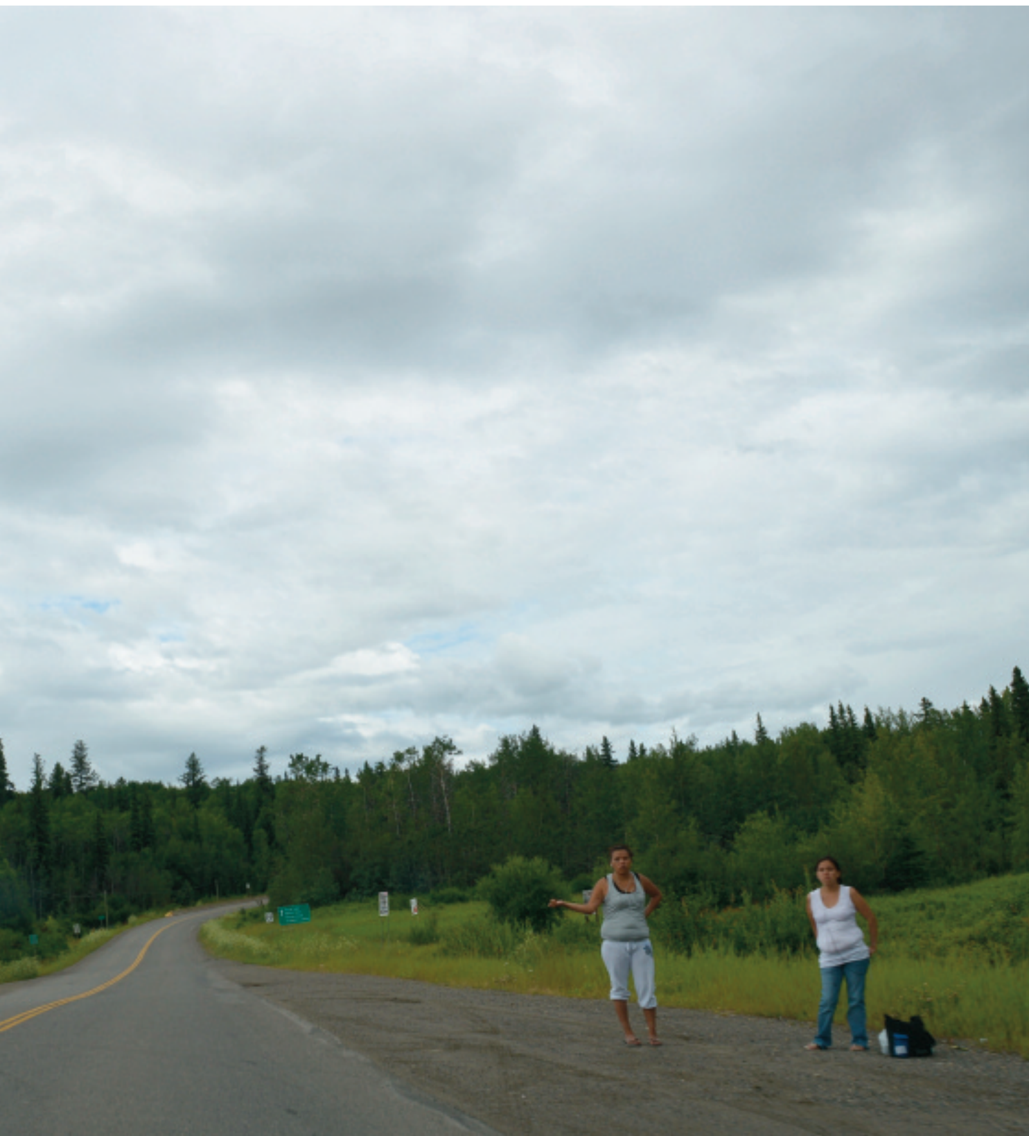
Two unidentified women hitchhike in northern British Columbia.