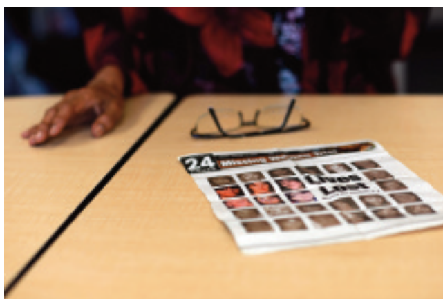
A woman shows a paper she has kept displaying the photos of women, some of whom she knew, who disappeared from the downtown eastside of Vancouver, British Columbia, in the 1990s.