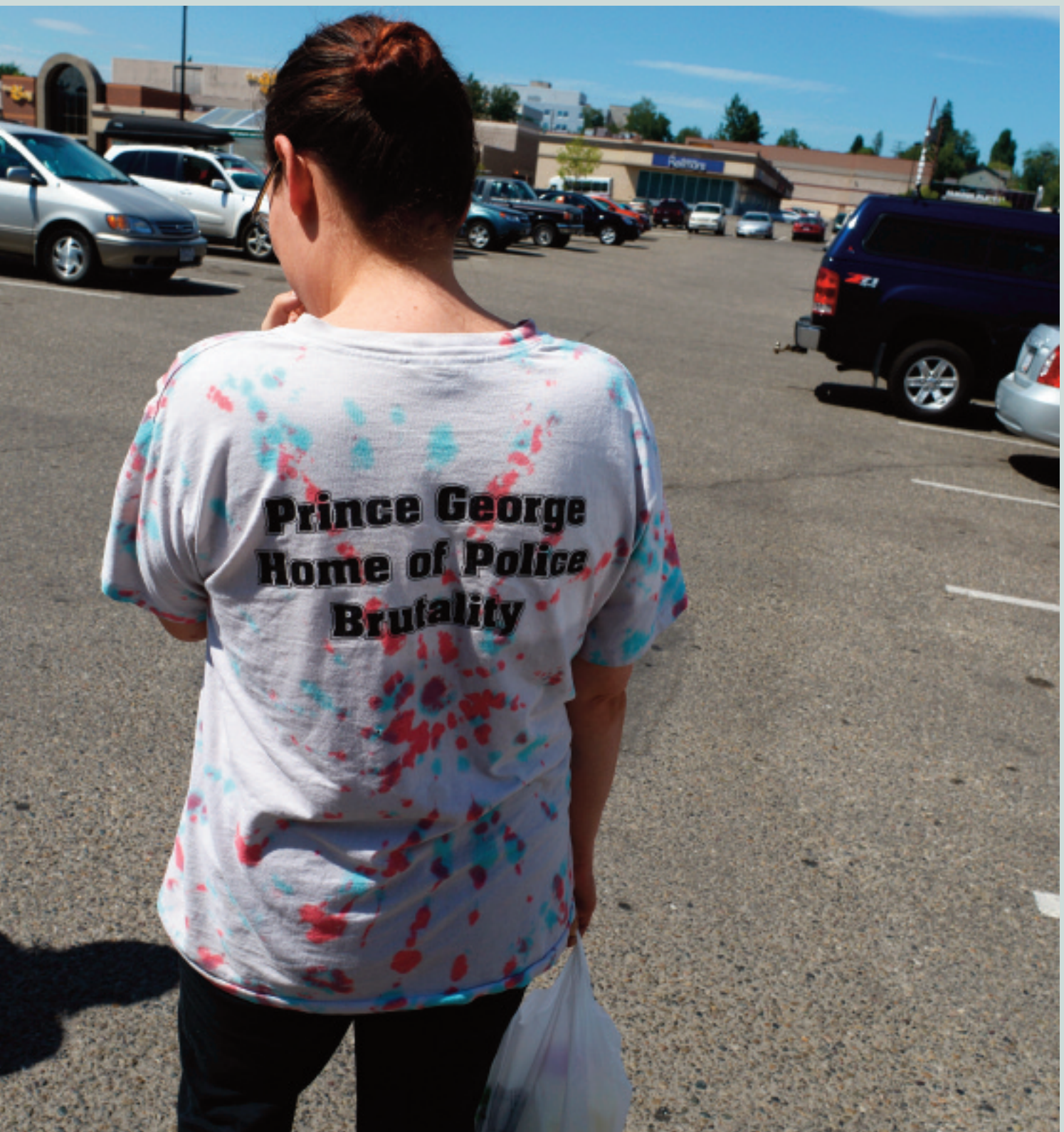
A woman wears a T-shirt with a slogan about police brutality in Prince George, British Columbia. In ten towns across northern British Columbia, Human Rights Watch documented failures in policing and protection of indigenous women and girls.