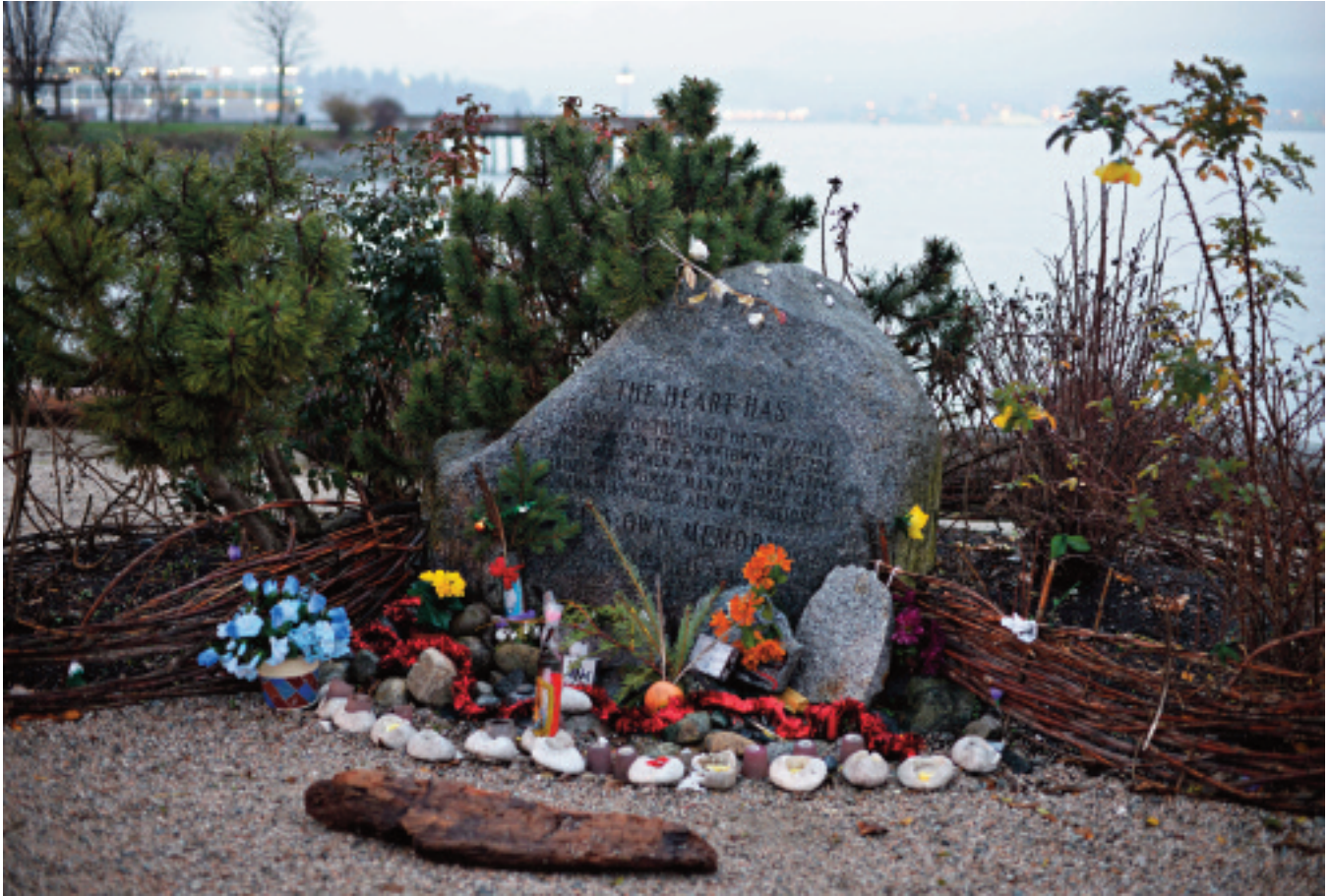
The memorial stone for the Downtown Eastside's missing and murdered women located in Crab Park, Vancouver. The stone reads: "The heart has its own memory, dedicated July 29 2007. In honor of the spirit of the people murdered in the Downtown Eastside. Many were women and many were Native aboriginal women. Many of these cases remain unsolved. All my relations."