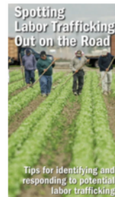
Labor Trafficking Brochure