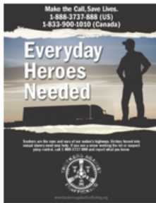
Everyday Heroes Poster