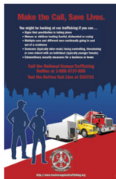
Signs to Look For Poster