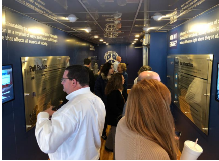
Large groups toured the Freedom Drivers Project on the Apache tour.