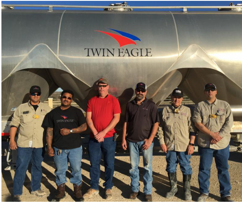
Twin Eagle drivers pose with their TAT temporary tattoos.