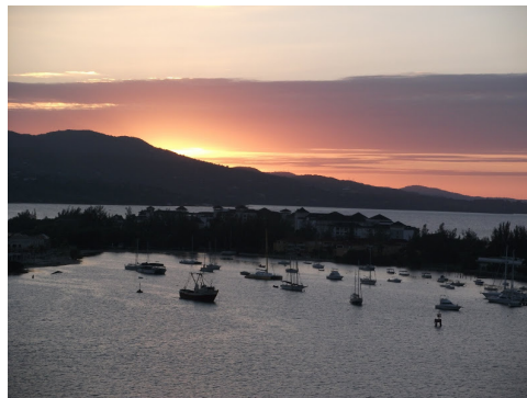
Sleepy harbor in Grand Cayman